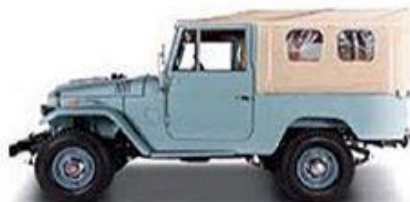
FJ43 SOFT TOP (1960–1984)

With its open-air configuration and fold-down windshield, this was the quintessential go-anywhere automobile. Riched armies seemed to like it, too. Restored: $10,000 - $100,000