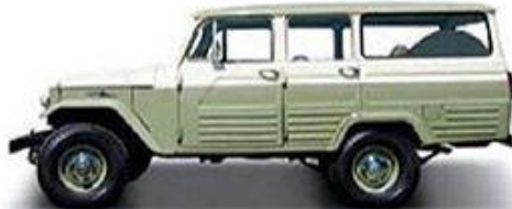
FJ45 WAGON (1963–1967)

The long-wheel base pickup version of the 45 was the mule of the FJ range. Ranchers and farmers couldn't get enough of it. Restored: $60,000 - $100,000