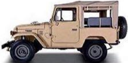
FJ40 SOFT TOP (1960–1984)

Presented here is the 1974-only factory color of olive green, the short-wheel base 40 came with a removable hard top and 4-speed manual transmission. Restored: $40,000 - $100,000