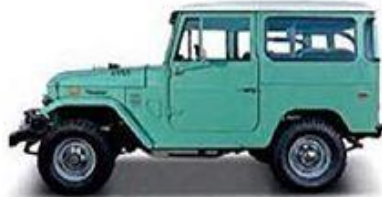
FJ40 HARD TOP (1960–1984)

The 25 was manufactured under license in Brazil with the US Willys Jeep as an obvious inspiration. It's the grandfather of the FJ line. Restored: $10,000 - $80,000