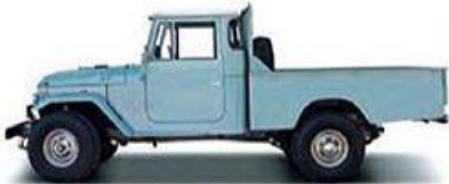
FJ45 PICKUP (1963–1967)

This medium-wheel base model was designed to transport cargo and people. It was offered in both two-door hard top and came as soft top. Restored: $60,000 - $120,000